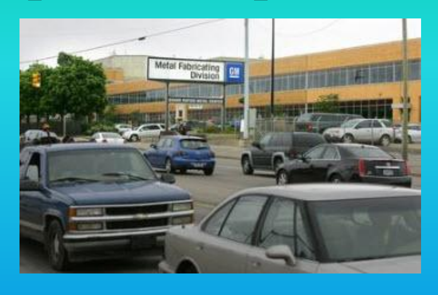
A typical site – this one located in Region 8